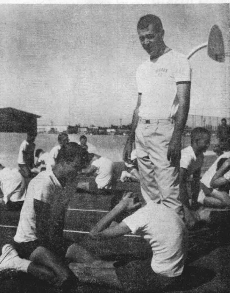
PHYSICAL FITNESS — Shown above are boys of the physical education class at Burroughs High School performing sit-ups.

FRIDAY "BATTLE CRY" (147 Min.) NOV. 17 SATURDAY "MATINEE" NOV. 17 SUN.-MON. NOV. 18-19 TUES.-WED. NOV. 20-21