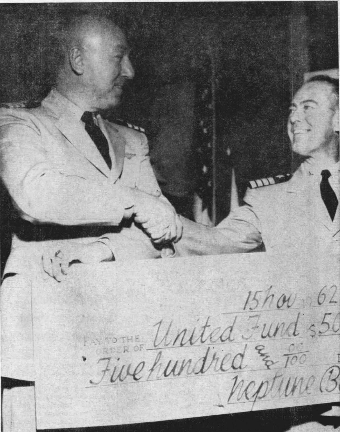
SURPRISE DONATION—Neptune Ball officials this week presented United Fund with $500 check, representing profits from community-wide ball held last month.