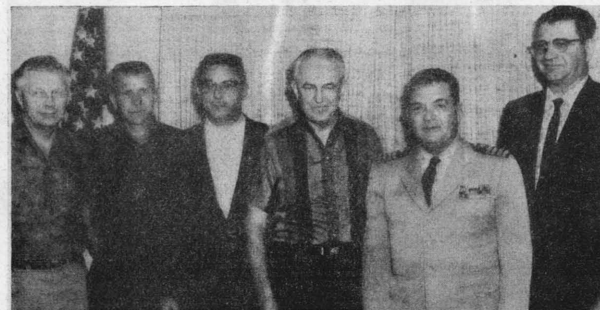
CEREMONIES WERE HELD recently to grant formal recognition by NOTS Command to Lodge No. 1548, International Association of Machinists, per Executive Order 10988. "Mount Wilson" Lodge No. 1548 represents its members in a unit composed of all per-diem employees of Pasadena Annex, whose duty station is Foothill, Morris Dam or Long Beach Facility. This unit excludes employ-