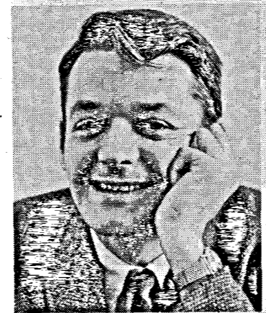
HAL HOLBROOK Humorist

The house lights will dim and the stage is transformed into a scene reminiscent of grandmother's parlor. There is a high old-fashioned lectern, an upholstered arm chair, and a table piled with books and a cut-glass water pitcher. Into this setting comes a white-haired spry humorist dressed in a white suit. His voice is cracked but when he speaks the evening becomes alive with Twain's wit and plunging satire.