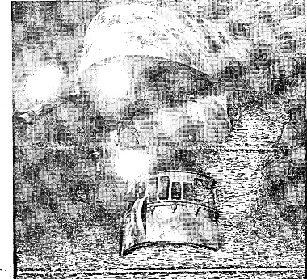
DEEP JEEP DESCENDS —Lights gleam on bowsprit below window port, in overhead float, and on TV camera boom, in tests near San Clemente Island.